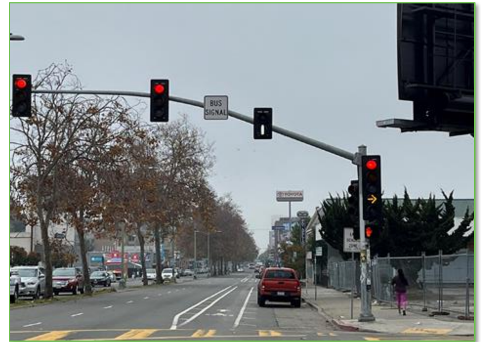
Bus Movement Active ("GO")