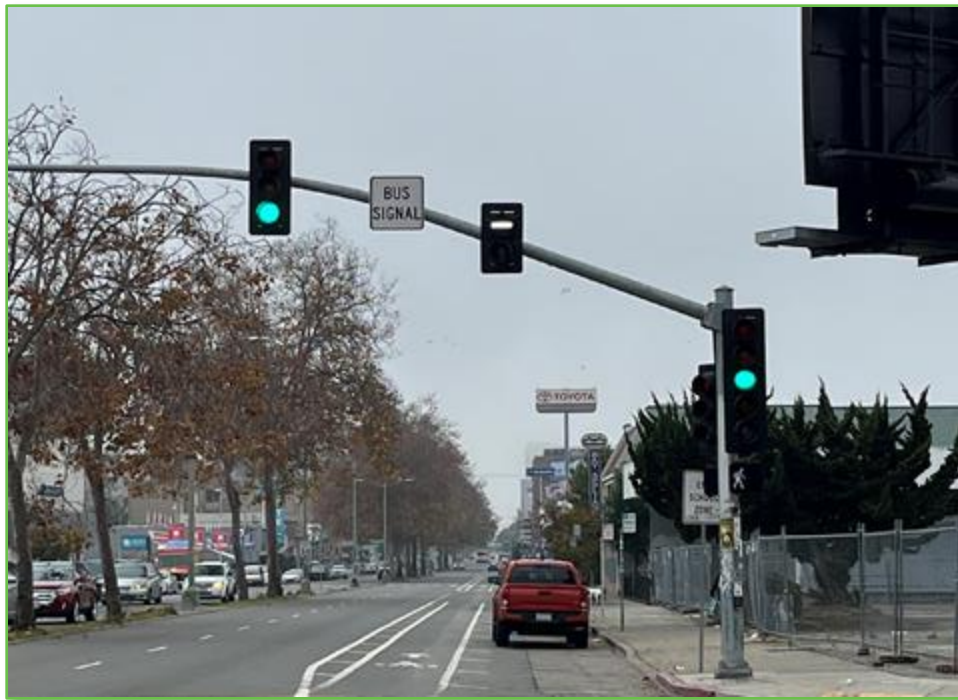
Bus Movement Wait ("STOP")