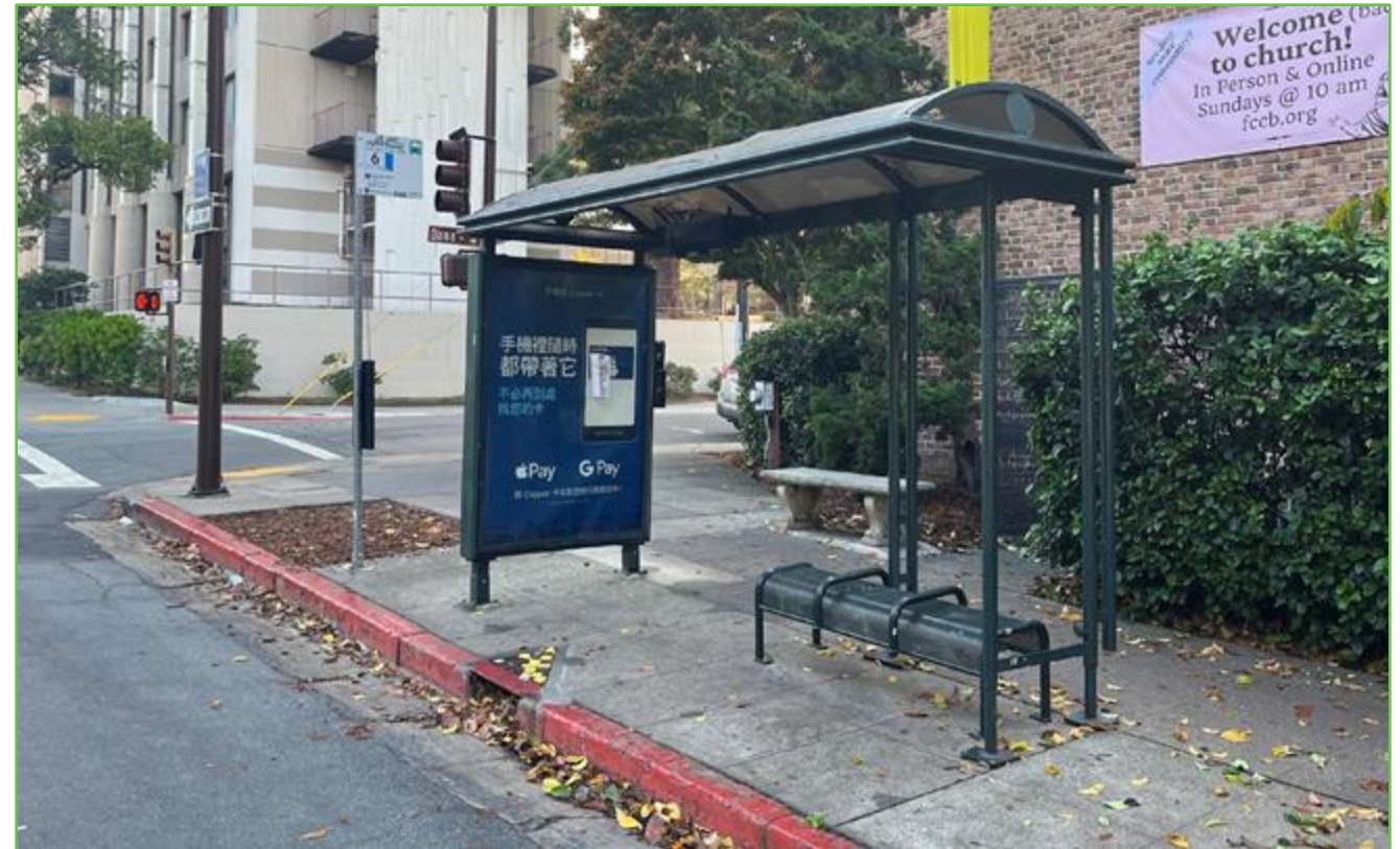
Existing Bus Stop Shelter (Open-back) at Durant and Dana