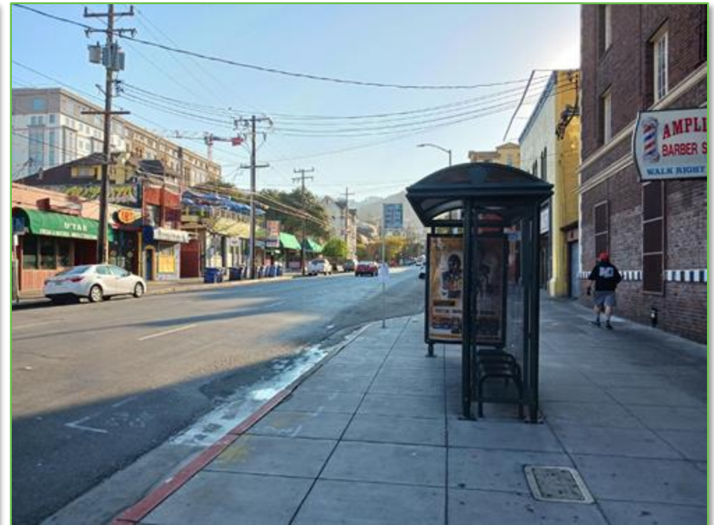
Existing Bus Boarding Bulb at Durant and Telegraph